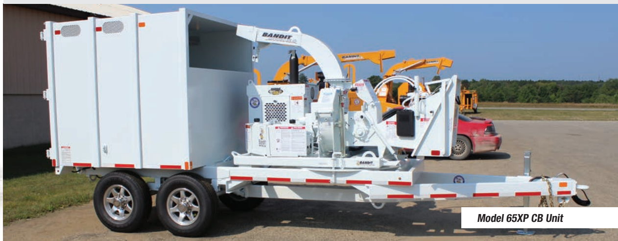
Model 65XP CB Unit