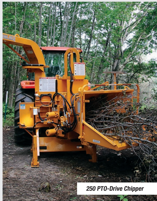
250 PTO-Drive Chipper