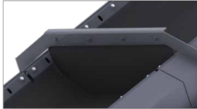
Anti Roll Flaps