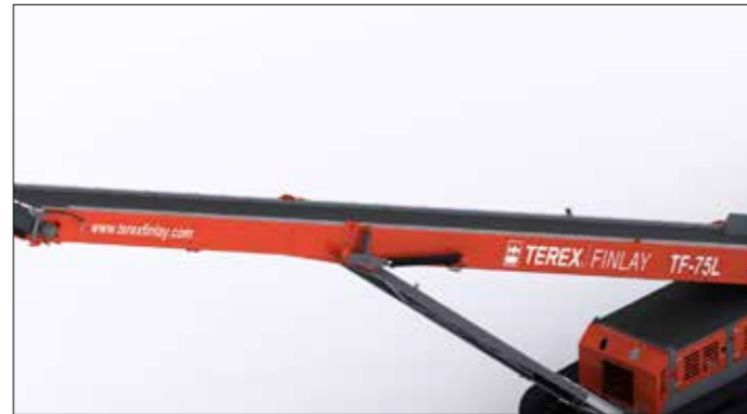
Full length Skirting