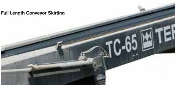
Full Length Conveyor Skirting