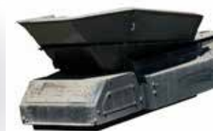
Feed Boot Extension