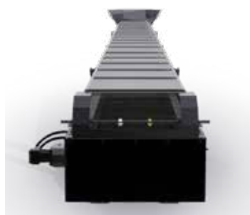
Head Drum Guards and Dust Covers